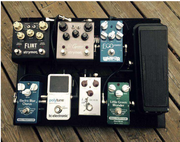
Figure 2: A real pedal board used by guitarists. Pedals are chained together before going to the amplifier.

For the WASABI project [6], the WIMMICS team from INRIA/I3S/CNRS developed the first online digital emulation of a tube guitar amplifier: the Marshall JCM 800, a popular amp used by many classic rock artists (AC/DC, Led Zeppelin, Guns and Roses etc.) [1, 2]