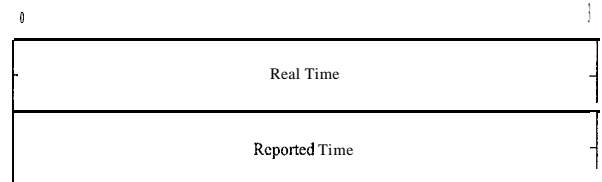
Fig. 3. The IPMP Real Time Reference Point

In addition to the echo packet exchange, the IPMP protocol contains an information packet exchange. This facility is used to retrieve information regarding precision and accuracy limitations of a clock represented in a delay measurement. In addition, the drift of the clock can be inferred with linear interpolation if multiple IPMP Real Time Reference Point (RTRP) objects, shown in Figure 3, are included in the response. The RTRP format presents a point that can be used to map between a reported time and the actual real time of a clock.