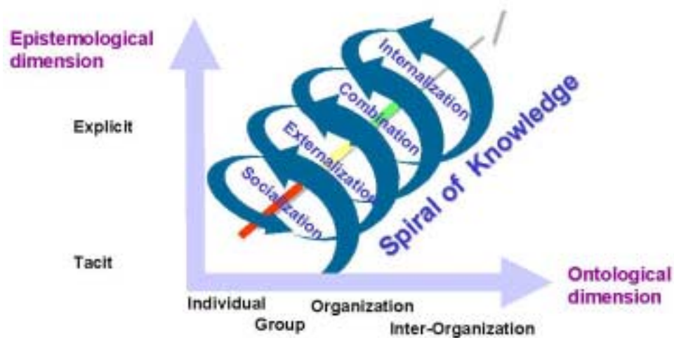
Figure 2 Knowledge Work Processes as Knowledge Spiral