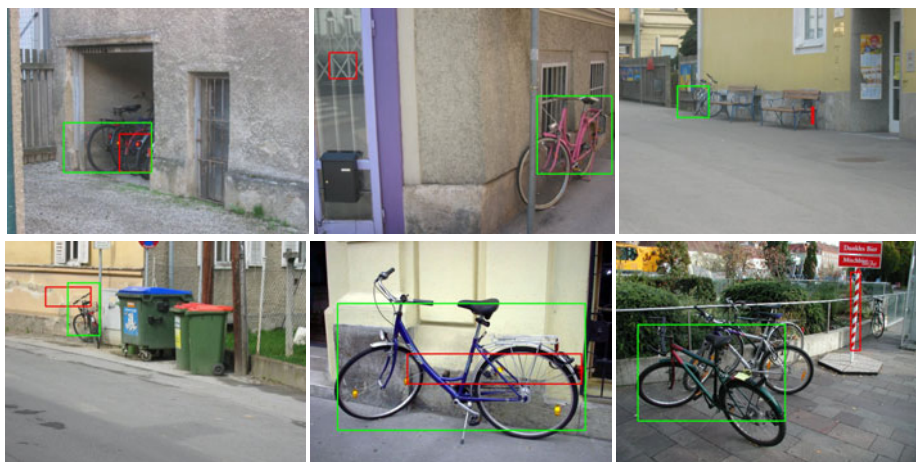
Fig. 3. Subwindow detection for NBNN (red) and optimal NBNN (green). For this experiment, all five SIFT radiometry invariants were combined. (see Section 4.4)

It can be observed that the non-parametric NBNN usually converges towards an optimal object window that is too small relatively to the object instance. This is due to the fact that the background class is more densely sampled. Consequently, the nearest neighbor distance gives an estimate of the probability density that is too large. It was precisely to address this issue that optimal NBNN was designed.