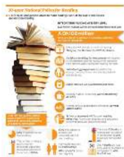
Figure 5: The text and image from a trustworthy tweet. The ELMo model misclassifies (as disinformation with 85.74% confidence) while the BERT and GloVe models correctly classify it as trustworthy (with confidences of 76.55% and 44.27%).

“rt a reading society embraces civilized values is adaptable”