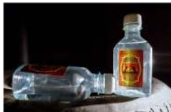
Figure 4: An example of a disinformation tweet that the GloVe ( M_3 ) model is able to correctly identify (55.17% confidence) but the BERT and ELMo ( M_3 ) models misclassify as propaganda (confidences of 48.29% and 60.86%).

“death by hawthorn the bath lotion that has killed over 70 russians”