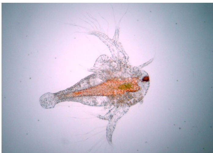
Fig. 2 Artemia salina nauplius (by Juan Camilo Jaramillo).