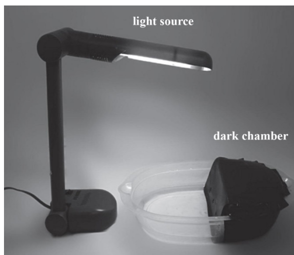
Fig. 1 Container used for hatching Artemia nauplii (Pellosi et al., 2013).