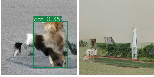
Figure 1: Sample generated images for The cat ran away from the dog (left) and The house ran away from the dog (right). In the left image, both a dog and a cat were identified by the object detector. The SOA-C scores for the two sentences were 1/3 and 0, respectively ( N = 3 , C = 1 (dog)).