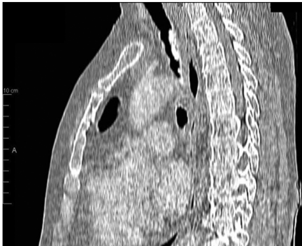
Figure 2. CT reconstruction in sagittal plane shows multiple protruding nodules in trachea

the front and side walls of the trachea along the entire length and on the main bronchi as on Figure 3.