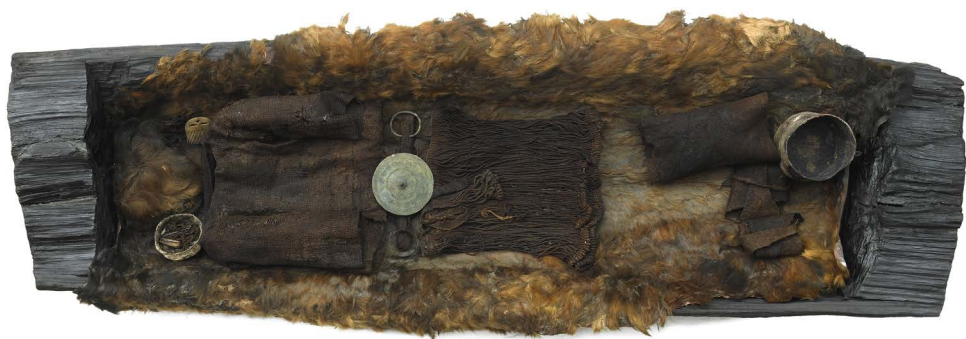
Figure 2. A photo of the remains of a Bronze Age high status female found inside an oak-coffin in a monumental burial barrow at Egtved, Denmark. The Egtved Girl's garments are extremely well preserved and her exceptional wool costume consists of several wool textile pieces as well as a disc-shaped bronze belt plate, symbolizing the sun.