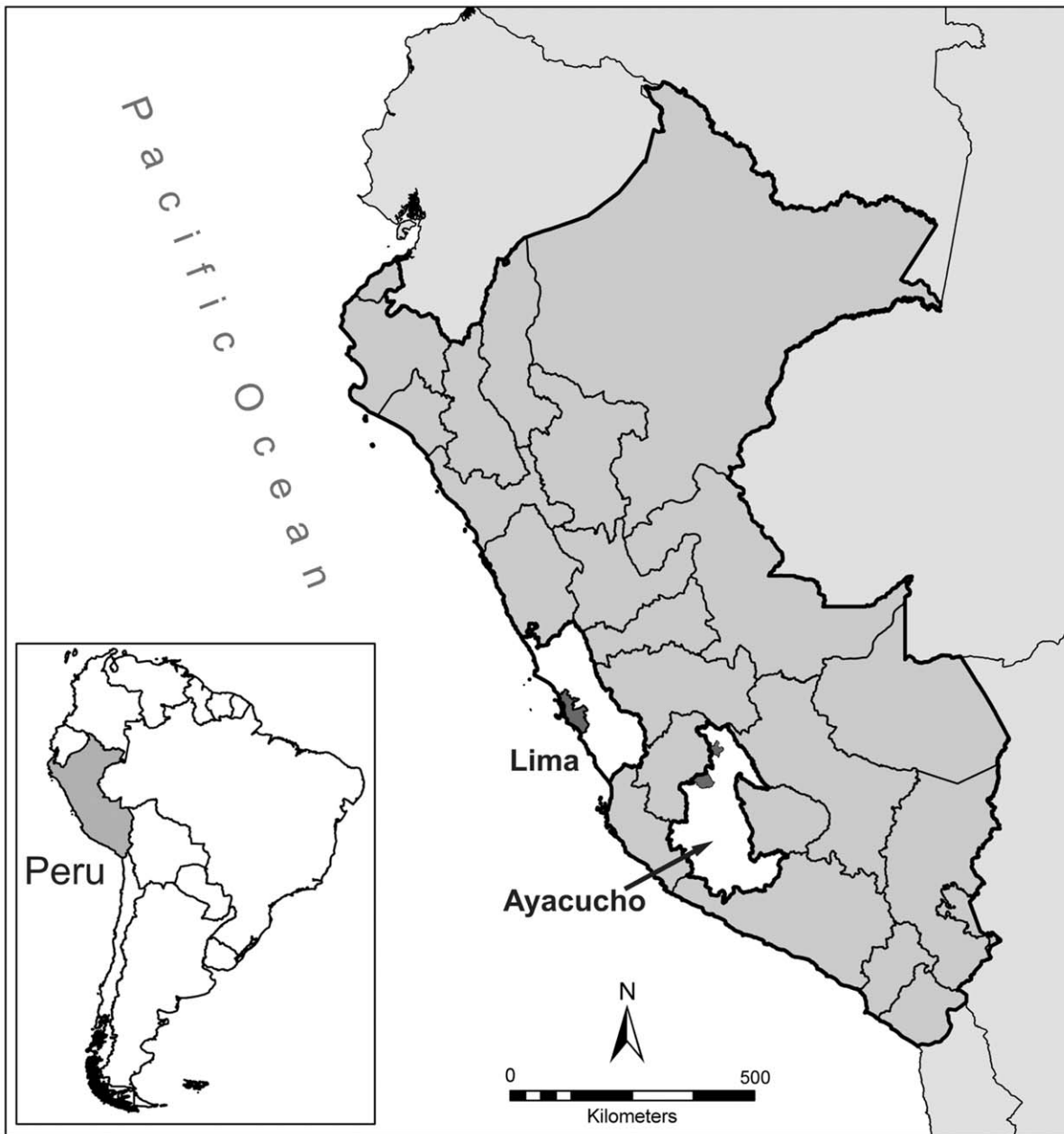
Figure 1. Map of Peru showing location of study sites. Lima and Ayacucho Regions illustrated in white. Dark grey areas illustrate Lima metropolitan area and Districts of Vinchos (south) and Santillana (north) in Ayacucho. doi:10.1371/journal.pone.0051795.g001

scores are widely used in paediatric research in order to adjust data for age effects so that characteristics can be compared across a range of ages. They represent the position of an individual within the frequency distribution for a given age in terms of standard deviations from the mean. The use of z scores therefore takes into account variation in body proportions at different ages, as well as differences in the variability of different anthropometric dimensions. All ANCOVA were performed on these z scores.