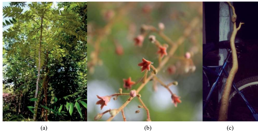
Figure 5: (a) Tree (b) Flowers and (c) Root of Eurycoma longifolia Jack.

species in this list, five species were already planted at the field in BBG, while four other species were still cared in BBG nursery. Alstonia agustiloba was the most planted species in BBG, with as much as nine specimens were planted in BBG, while Morinda citrifolia and Alstonia scholaris each had only one specimen planted in BBG. Areca catechu and Eurycoma longifolia had three specimens planted in BBG respectively. Alstonia angustiloba and Eurycoma longifolia were also spontaneously growth in some parts of BBG. This condition confirmed the importance of BBG as one of plant conservation sites, especially for Kalimantan plant species with traditional medical properties.