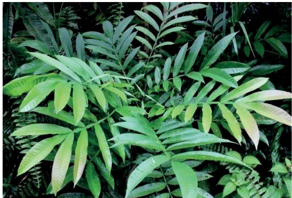
Figure 3: Leaves of Peronema canescens Jack.

to treat malaria and tonic drink [9]. The leaves of this species (Figure 3) were also used to treat malaria in South Sumatra region. Ethanol, acetone and water extract of Peronema canescens leaves was showed inhibition ability toward P. falciparum growth in vitro, as well as toward P. berghei growth in vivo [12].