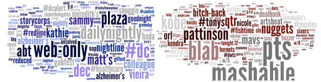
(a) Degree centrality-based (b) Burt's constraint-based

Analyzing big data through visualization. It is challenging to make sense of large quantities of data. We have shown that one effective way of analyzing such data is to visualize it. This methodology is effective in the sense that simple data mapping has allowed us to find out who competes with whom and, more importantly, which are the hidden opportunities in the publishing industry and who is tapping into them.