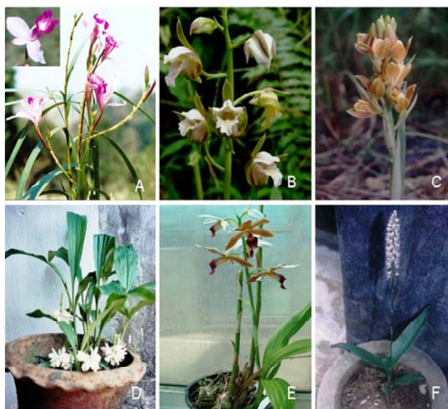
Fig. 2 Some terrestrial medicinal orchids of Bangladesh. (A) Arundina graminifolia (B) Eulophia nuda . (C) Eulophia sp. (D) Geodorium densiflorum . (E) Phaius tankervilleae . (F) Peristylus constrictus .

The therapeutic potentials of 29 indigenous orchids of both terrestrial (11) (Fig. 2) and epiphytic (18) (Fig. 3) for the treatment of different diseases and ailments including