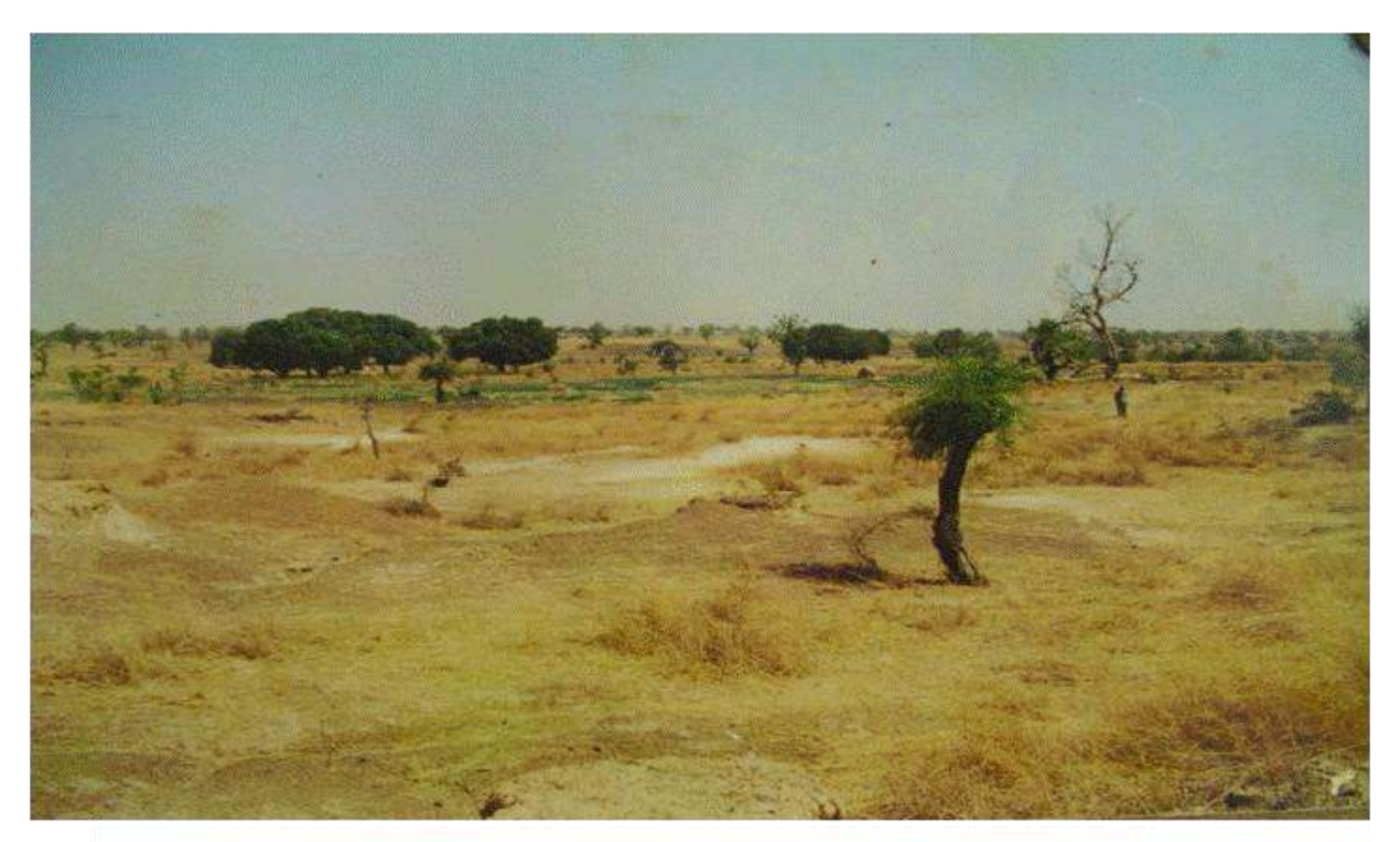
Terrain infertile typique sur lequel le fondateur du CD2A a choisi pour commencer les activités pratiques d'Agro écologiques