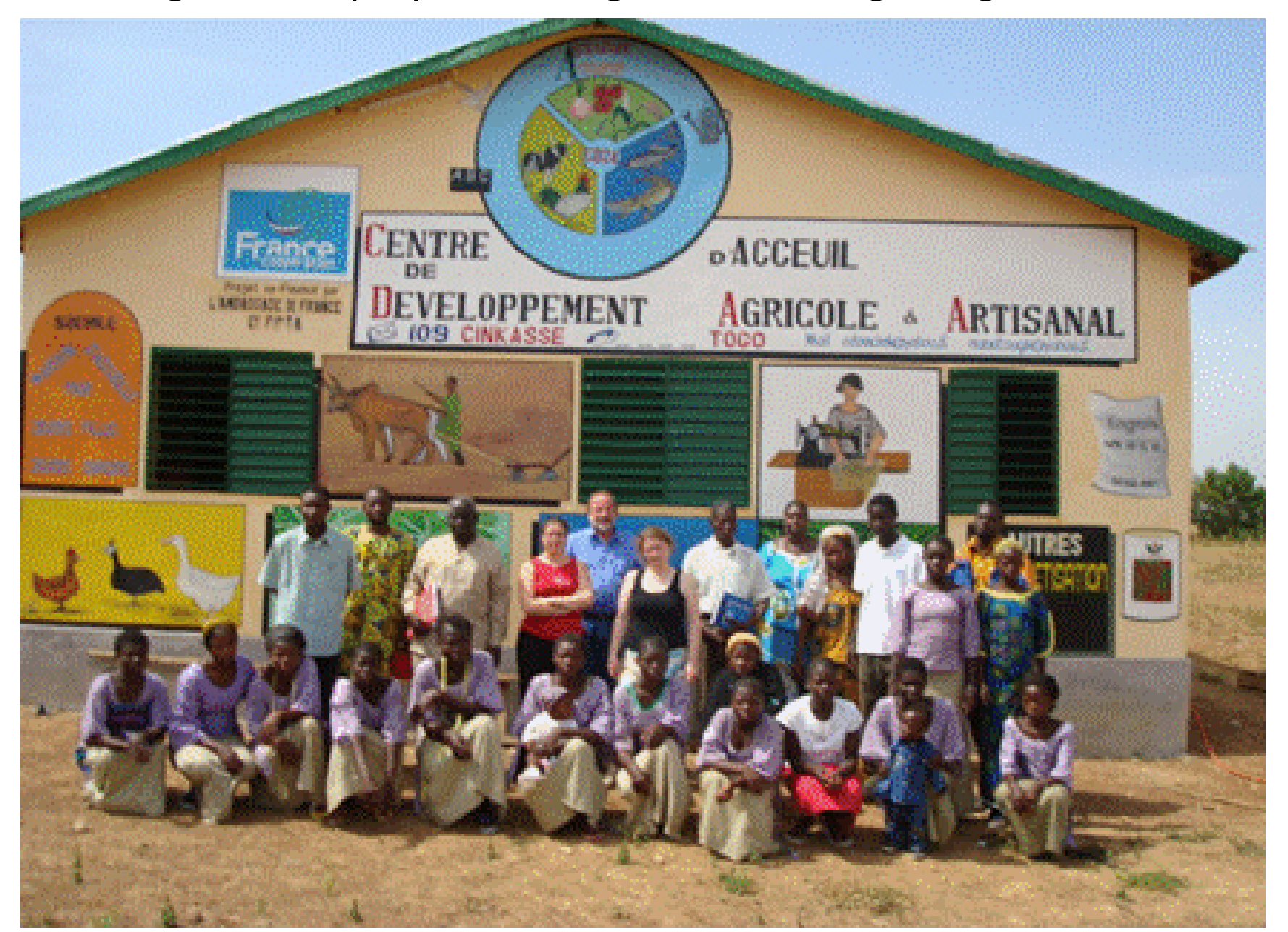
Training, self-employment, forget about emigrating