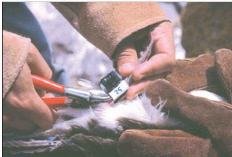
Figure 3. Researchers attach a leg-mounted geolocator to a Cory's shearwater.

We provide the first year-round tracking study describing the wintering grounds and migratory routes for different populations of a marine migrant. Though birds range through much of the Atlantic Ocean, the actual wintering areas that sustain most of the world population of this species are restricted to four specific, oceanographically defined areas (Figure 4). These are the Benguela and Agulhas Currents, the southern part of the Brazil Current, and the Canary Current. All of these Atlantic coastal biomes are associated with major upwelling phenomena, showing high chlorophyll- a concentrations and high rates of primary production (Longhurst 1998), and thus sustaining abundant food for seabirds. To reach these areas,