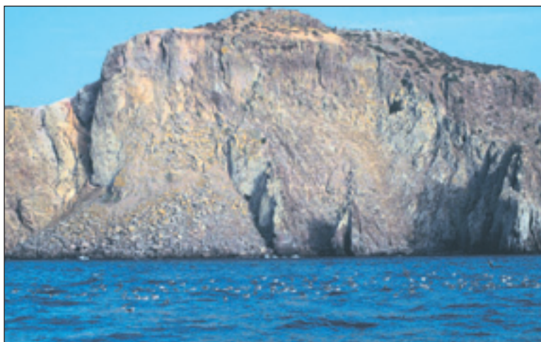
Figure 2. Cory's shearwaters near a colony at the Chafarinas Islands in the Mediterranean Sea.

In 2002, we tracked the complete non-breeding cycle of 22 Cory's shearwaters breeding in the Azores Islands, the Canary Islands, and the Mediterranean (Figure 2). Our goals were: (1) to describe complete annual journeys for individuals, the location of wintering areas of a long-distance migrating seabird, and associations with the marine environment; (2) to investigate interpopulation differences in migration patterns and population mix in wintering areas; and (3) to evaluate the anthropogenic risk faced by migrat-