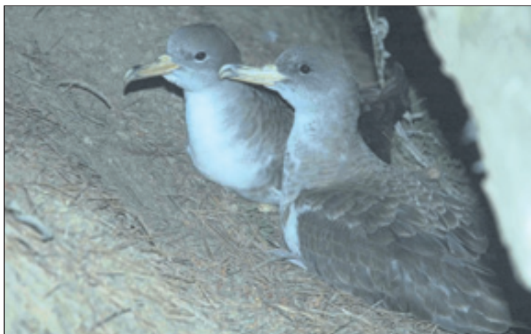
Figure 1. Male and female Cory's shearwaters ( Calonectris diomedea ).

tions indicate that many individuals are trans-equatorial migrants (Camphuysen and Van Der Meer 2001). It has long been believed that the Mediterranean subspecies ( C diomedea diomedea ) migrates to the eastern south Atlantic, and the Atlantic subspecies ( C diomedea borealis ) to the western south Atlantic (Thibault et al. 1997; Camphuysen and Van Der Meer 2001). However, satellite-tracked shearwaters from the island of Crete exhibited more variability, with some birds wintering in tropical and subtropical waters north of the equator, although these data are limited to a few birds tracked over short periods (Ristow et al. 2000).