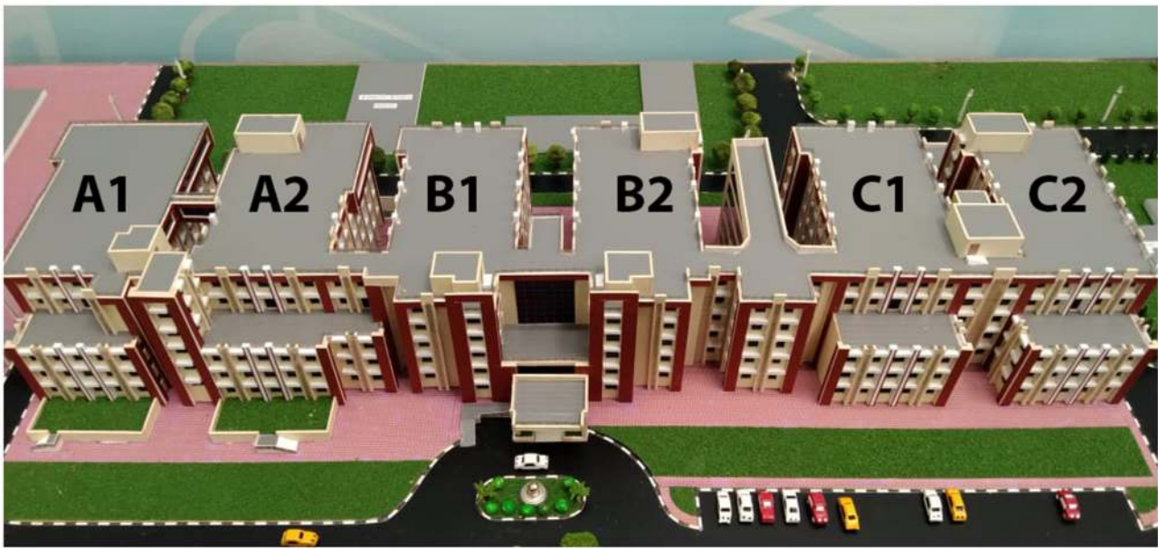
FIGURE 1 | A model of the hospital transformed to function as COVID-19 facility. The design resembles a comb with the corridor representing the shaft and the blocks representing the comb's teeth. There are five levels and a basement.

effectively handling the pandemic. The essential services such as emergency, intensive care unit, bronchoscopy, and others were continued.