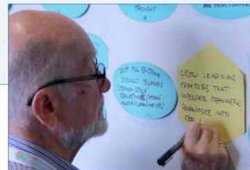
Box 1. The research methodology.

Multiple checks and balances were used throughout the process to ensure the results and narrative reflected the views and perspectives of researcher-participants and reduce biases created by interactions of research-participants acting in different roles, such as facilitators, analyst and participants in accordance with suggestions for enhancing rigor [36]. This included: (1) Sharing and deliberation of ideas in the parallel workshops at the conference; (2) careful coding and preliminary analysis using multiple analysts who had been present in different workshops; (3) feeding back preliminary analysis to participants during the conference; (4) multiple iterations of cross-checking by multiple analysts post conference; (5) working with comments from the researcher-participants about the overall narrative; and (6) final approval of the narrative through participants by agreeing to be a co-author before the paper was submitted. In this last stage, only one person declined to be an author, while four newly joined after email communication errors had been clarified. Combined with the facilitators and analysts, this led to the total of 183 authors on the paper. In conclusion, while a different group of participants may have led to