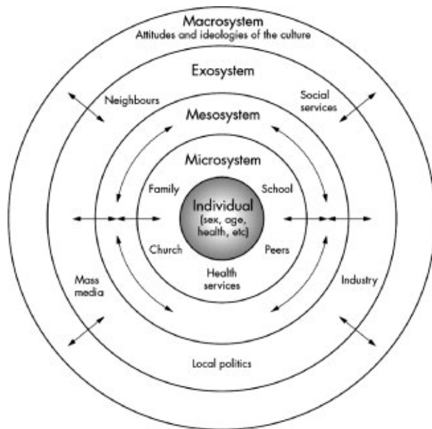
Figure 1. Biosocial ecological model of health.

The transtheoretical stages of change model [33, 34] assesses an individual's readiness to act on new behaviors that promote health. Stages of change include precontemplation, when individuals are not intending to take action in the foreseeable future; contemplation, when an individual is considering change; preparation, intention to take action in the immediate future; action, where specific lifestyle modifications are being made; and maintenance. The model describes processes that guide the individual through the stages of change and consists of such core constructs as decisional balance and self-efficacy (Fig. 2). These processes suggest strategies that can be applied to effect change, and that are most effective when matched to the individual's stage.