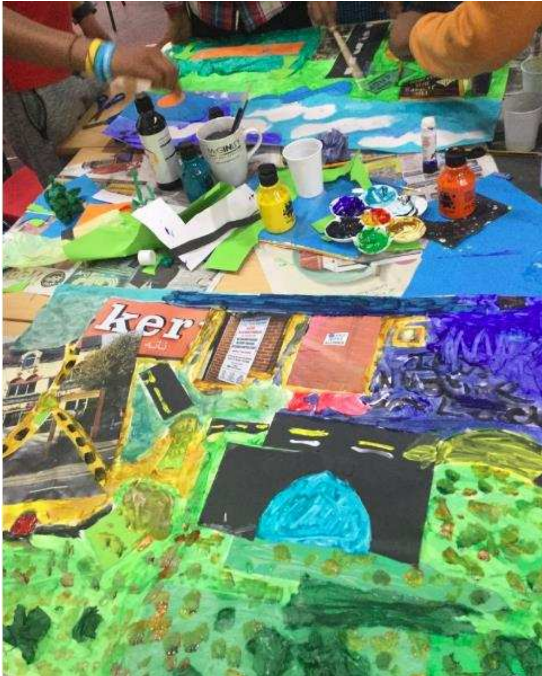
Figure 5: collage in progress

another layer of colour into their work. As well as a practical measure, this also allowed them to develop themes from the text and imagery before deciding how the colour might affect their collages.