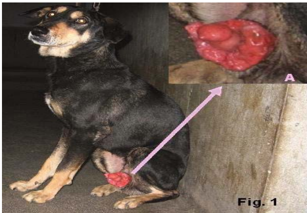
Fig. 1. Photograph showing circumcised growth at the base of penis causing paraphimosis (See inset Figure A).

muscles (Kustritz, 2001, Fossum, 2007). TVT as an etiology to paraphimosis has rarely been recorded in the literature. Boscos and Ververidis (2004) recorded only 0.8% incidence of paraphimosis due to TVT.