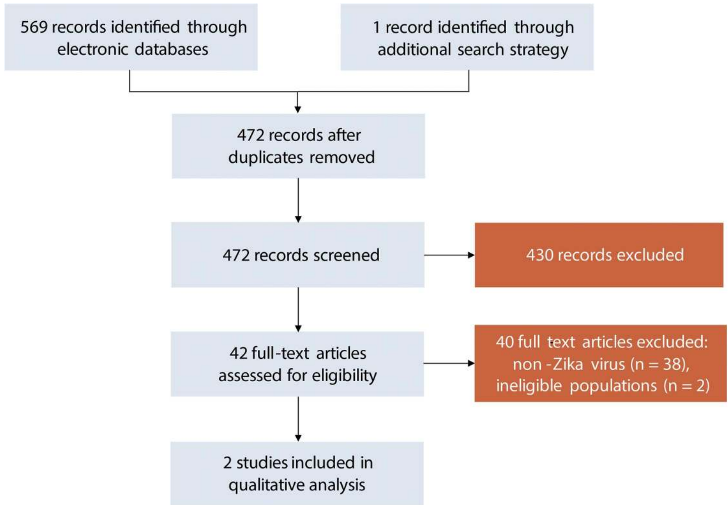
Fig 2. Systematic review process.

https://doi.org/10.1371/journal.pntd.0005528.g002