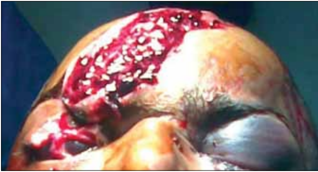
Figure 1: Clinical photograph showing lacerated wound extending from right supraorbital margin to right parietal region with herniation of the brain tissue with right eye globe rupture