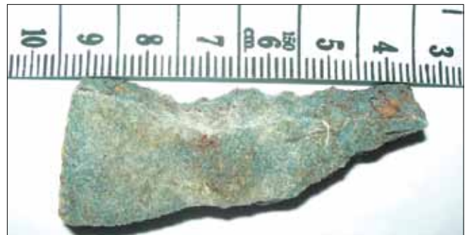
Figure 4: Figure showing extracted foreign body (ceramic stone)

prescribed decongestants (mannitol, frusemide) along with antiepileptic (phenytoin) and antibiotics during the postoperative period. He was electively ventilated for 72 hours, gradually weaned off, and extubated. The intracranial pressure (ICP) was monitored in the postoperative period for three days and was within normal limits. Postoperative course was uneventful and the patient was discharged on postoperative day 11. At the time of discharge, the patient's neurological response was E3V2M5 (GCS = 10). The patient recovered in due course of time and recovered to GCS of 15 at six-month follow-up visit.