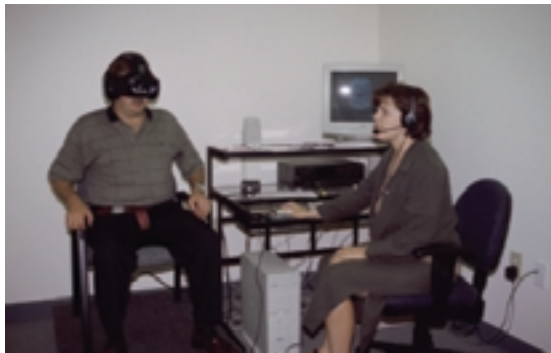
1 Typical office setup for virtual reality therapy.

As a second example, we can look at the approximately 40 million disabled Americans. 4 This number includes people with restricted mobility, reduced sensory motor capabilities, and communication and intellectual deficiencies. Aging of the disabled has compounded the effects of disability on our society, resulting in a cost to society of $300 billion. 5 The lead-