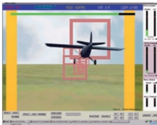
6 Ankle rehabilitation exercise in VR. 40

©2001 Rutgers University. Reprinted by permission.