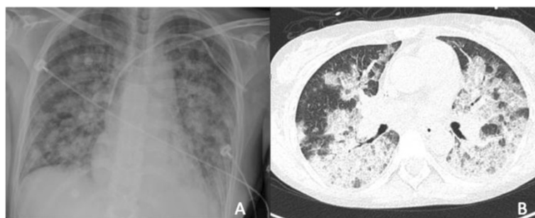
Figure 1 Chest X-ray and CT scan. (A) Chest X-ray where bilateral pulmonary infiltrates were observed. (B) Computed axial tomography (CT) scan where mixed basal pulmonary infiltrates and alveolar collapse were observed. Images were taken at the time of admission (day 1).

Bronchoscopy has been recommended in the case of suspicion of DAH in which clinical presentation is atypical, as it confirms the diagnosis. In subacute cases, methods such as the quantitative score of hemosiderin-laden macrophages in the BAL fluid sample or increased red blood cell counts are used [6]. Hemosiderin, a breakdown product of