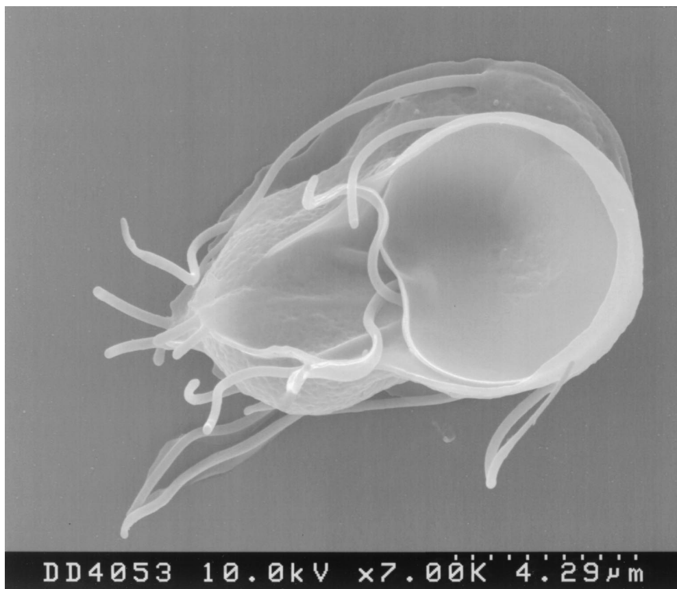
FIG. 1. Ventral surface of a Giardia lamblia trophozoite imaged by scanning electron microscopy. It demonstrates the disk and flagella. A second trophozoite is seen behind it. Magnification, \times 8,100 .

host and thus evade immune detection (181). Given these multiple potential mechanisms, a multifactorial process is likely.