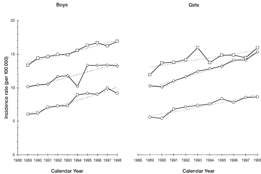
Fig. 1. Trends in age-specific incidence rates for boys and girls, pooled across regions. ○, 0–4 year age group; ◇, 5–9 year age group; □, 10–14 year age-group