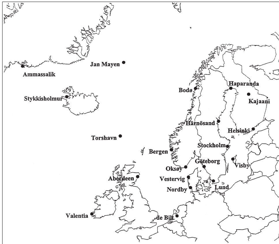
Fig. 1. Stations with long time series of 3 pressure observations per day