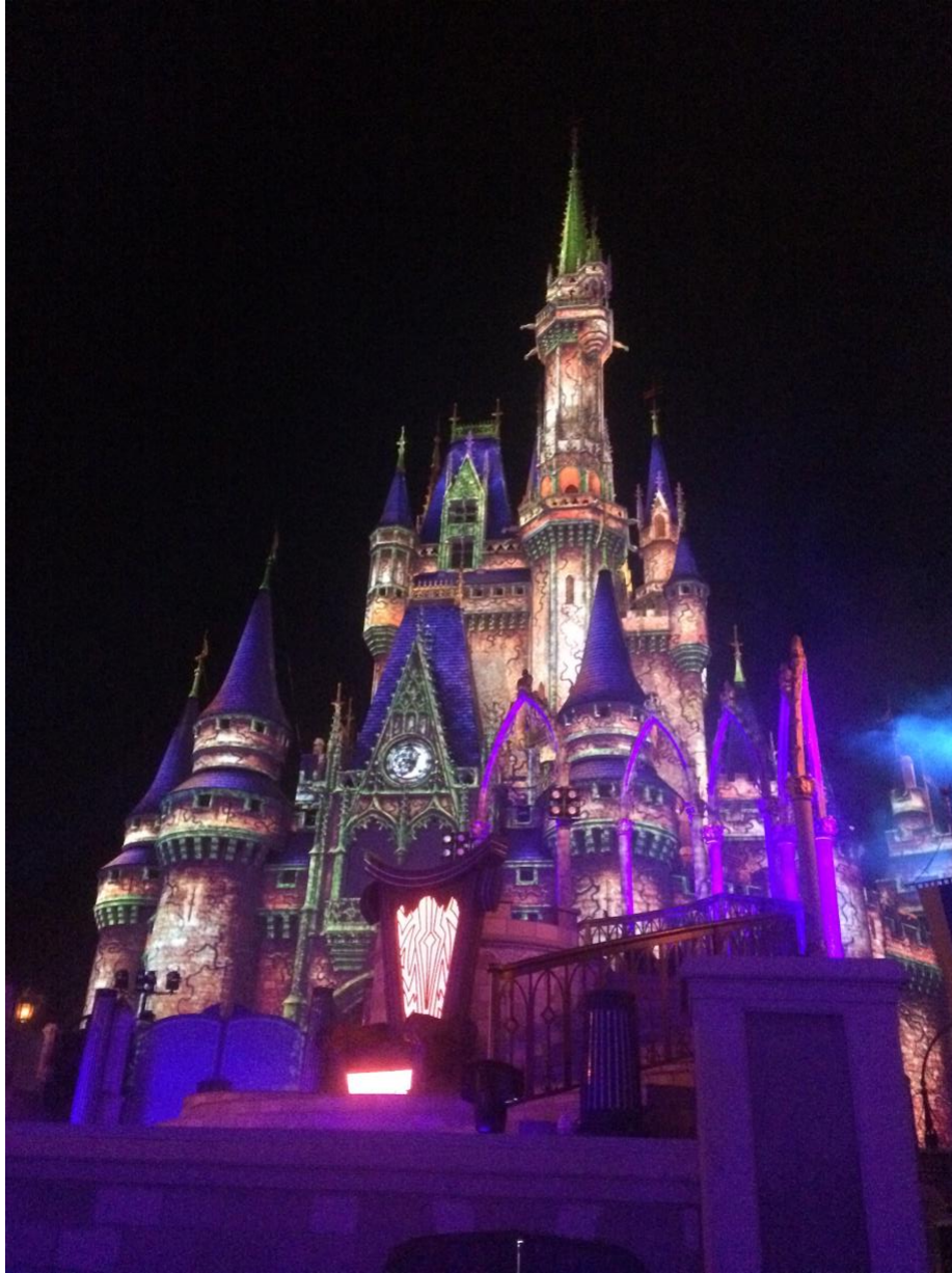
Figure 3: Cinderella's Castle during Disney Villains After Hours special event.

Slight additions were made to the Pirates of the Caribbean ride as well as the Space Mountain rollercoaster to honor the night, while the general feel in the theme park was much darker and eerier. The event ended at 1 A.M. with Maleficent's fire-breathing dragon parade float barreling down Mainstreet USA. As we filed out of the park, we were seen off by classic Disney villains