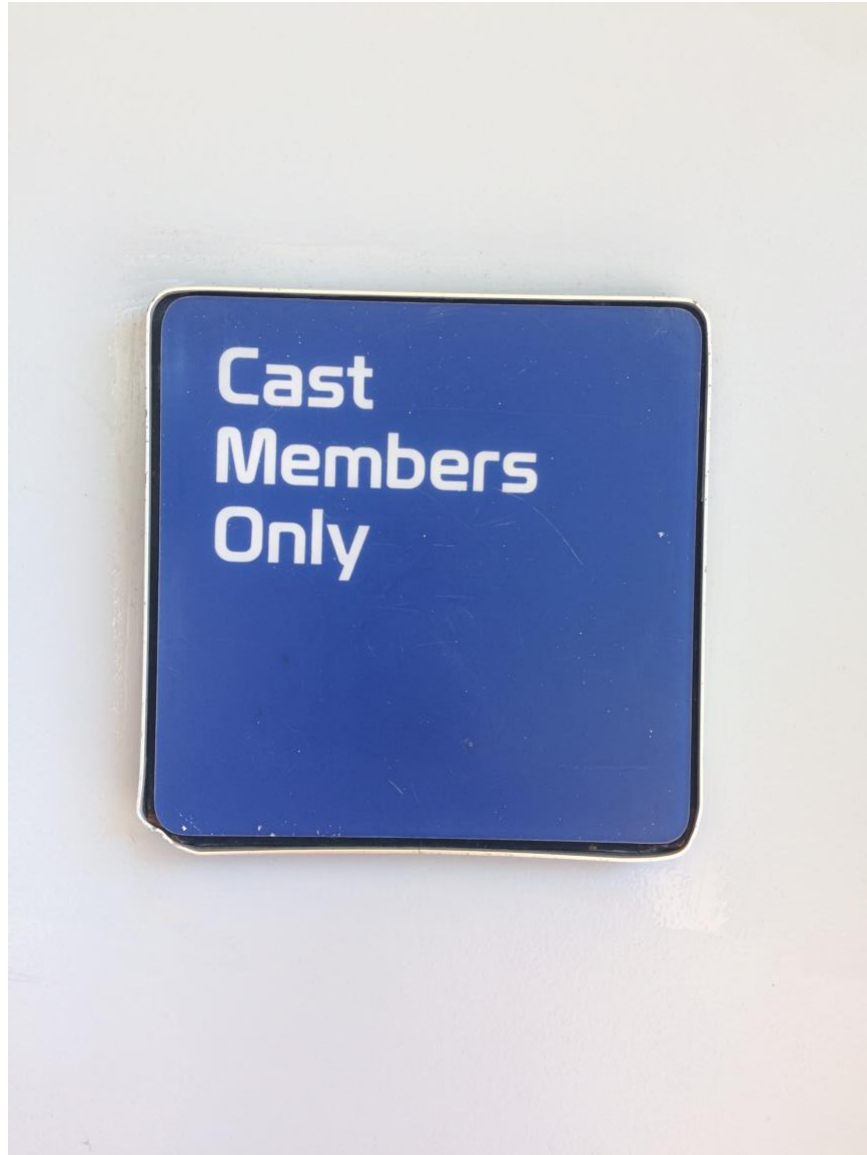
Figure 1: Cast Members Only sign on custodial supply closet in Walt Disney World.

Signs and placards such as the one pictured above are in abundance in Walt Disney World. They are often used to designate supply closets, break rooms, maintenance areas, stocking rooms, etc. While these areas serve very normal, unmagical purposes, marking them as accessible to cast members only while simultaneously withholding their true mundane purpose sprinkles a little pixie dust on everyday items, like mops and bleach. At the same time, these inscriptions remind