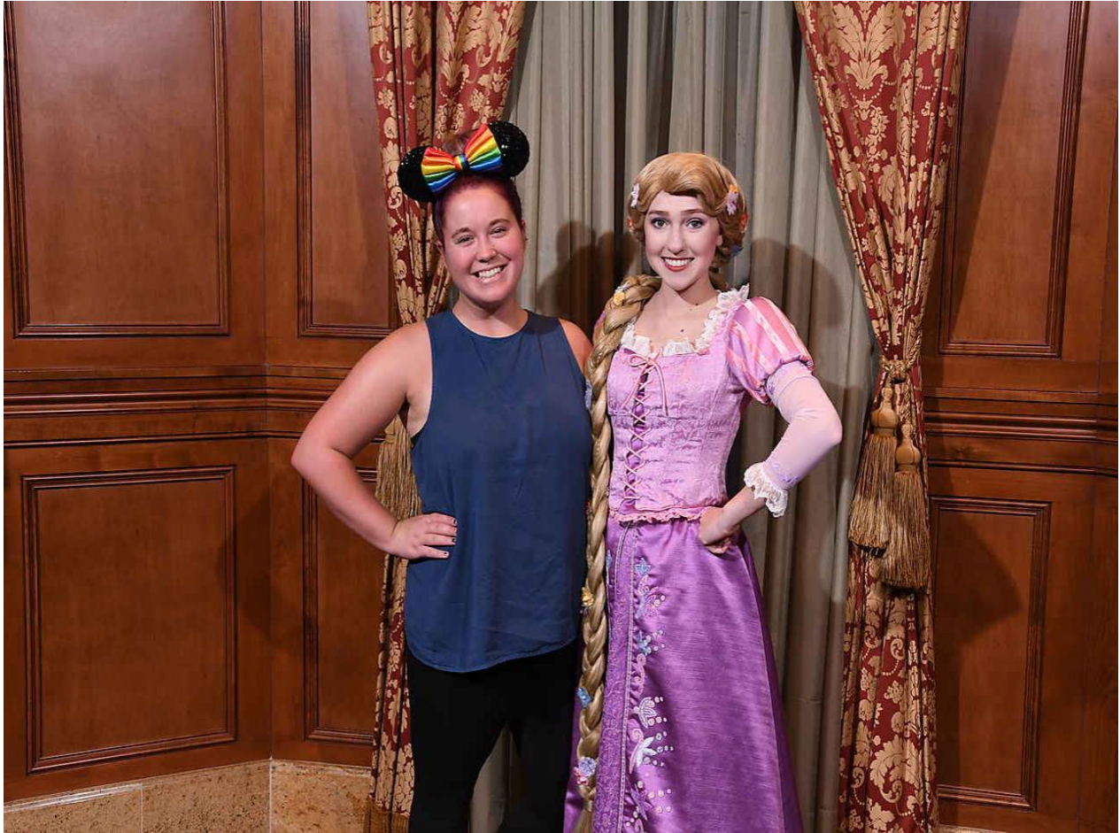
Figure 2: Photo with Rapunzel posted to my social media account.

media; below is a photo that I posted to one of my social media accounts following a long day of research at Magic Kingdom.