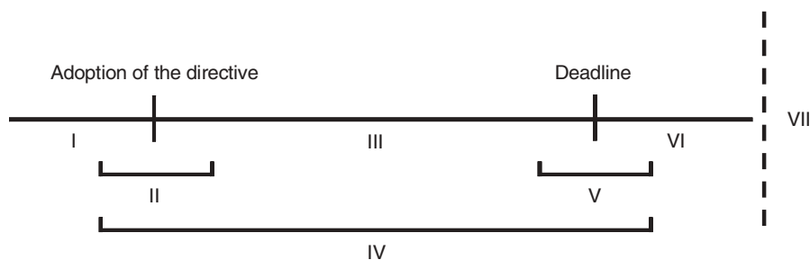
Fig. 1. Classification of directives according to their timeliness