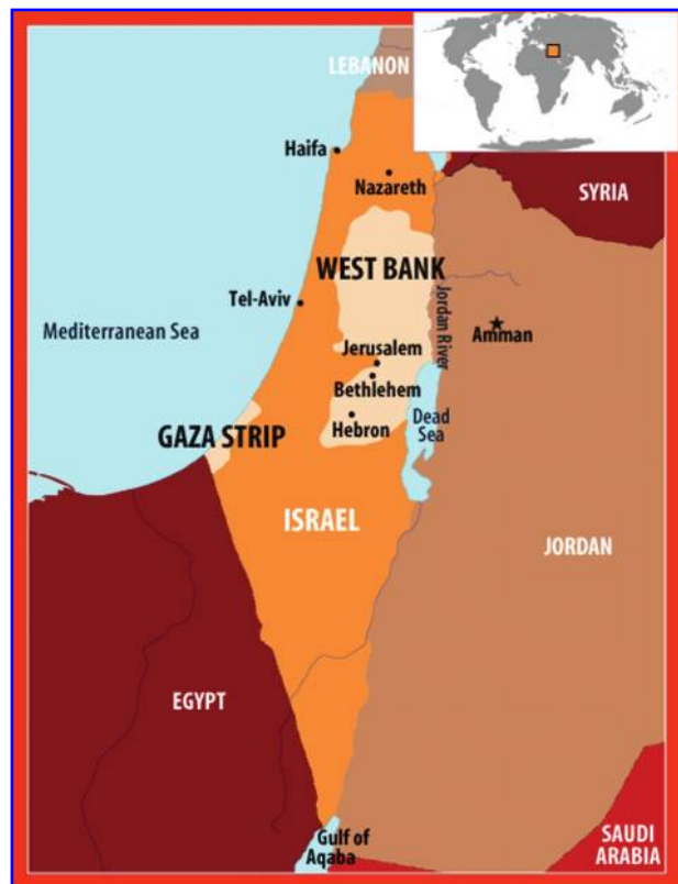
Figure 1. MECIDS Region. Color images available online at www.liebertonline.com/bsp .

Drawing on an idea born at the height of the Second Intifada in 2002, the Nuclear Threat Initiative's (NTI) Global Health and Security Initiative (GHSI) collaborated with another international nongovernmental organization, Search for Common Ground, to facilitate the establishment of a regional disease surveillance network amid the historically divided governments of Israel, the Palestinian Authority, and Jordan. The network that developed from this initiative was MECIDS, which brought together public health experts and ministry of health officials in the region to improve the region's ability to detect and respond to infectious disease threats through coordinated surveillance and joint epidemiologic and laboratory training (Figure 1). Before the development of MECIDS in 2003, cooperative