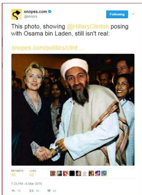
Figure 2. Example of Snopes debunking a social media rumor on Twitter (March 6, 2016);

https://twitter.com/snopes/status/706545708233396225