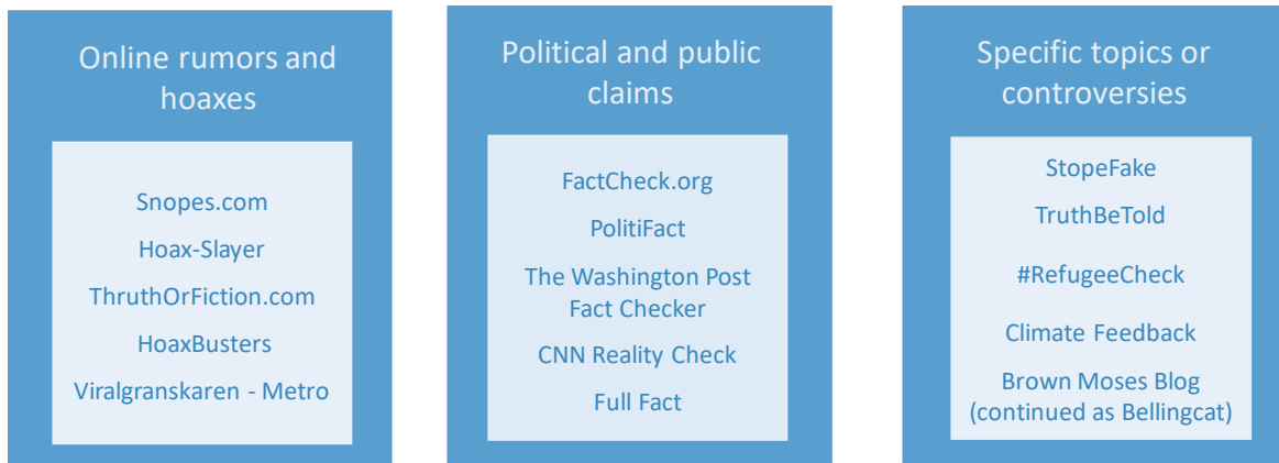
Figure 1. Categorization of fact-checking services based on areas of concern.