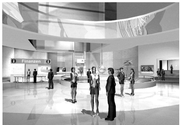
Figure 3 An agent-populated virtual servicescape

A customer will be able to visit the virtual servicescape in the form of an avatar and engage in shopping activities by interacting with the salesperson avatars, which will be implemented as agents. Whilst salespersons will be implemented as anthropomorphic agents, the agent implementation for customer avatars is not essential, although it could be considered as an option for an advanced type of customer interaction within the e-servicescape in the future. Salesperson agents will be divided into two categories, mall agents and business agents, depending on their role in the e-servicescape. Mall agents will welcome and greet the customer visiting the virtual mall and guide him or her to