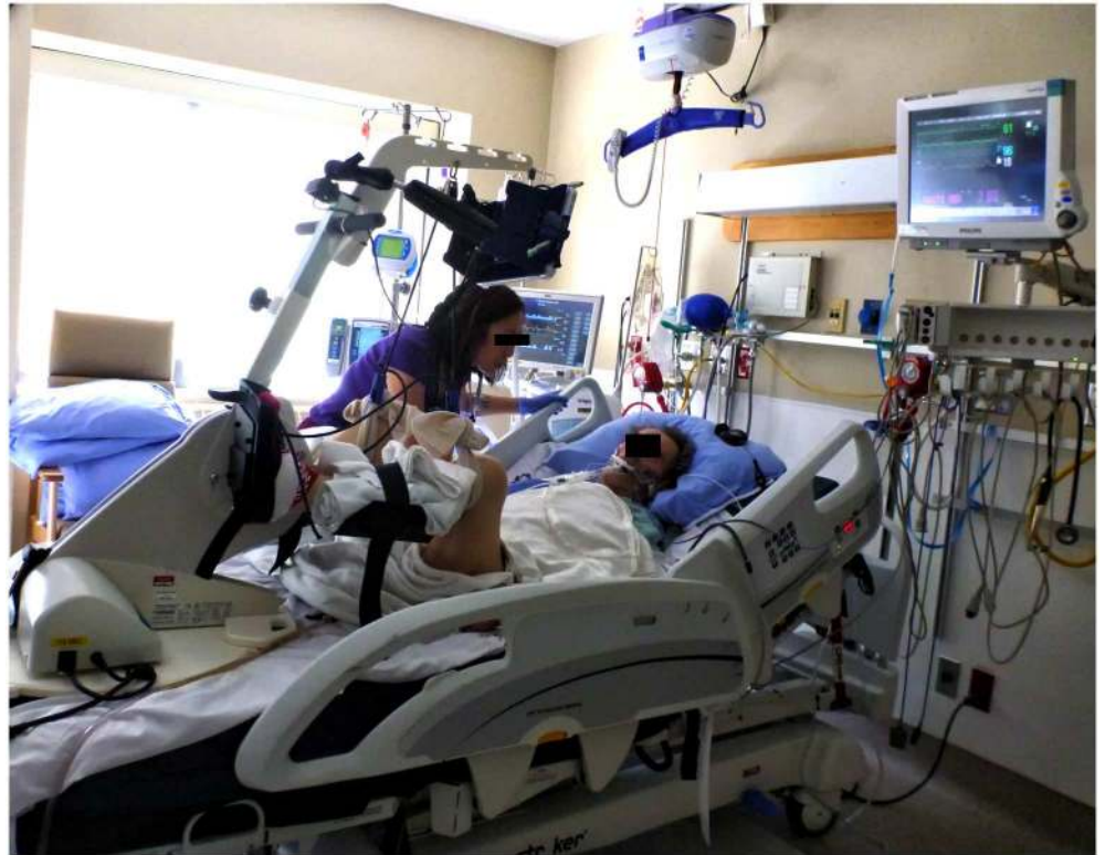
Fig 1. Example of in-bed cycling. This figure demonstrates a patient in the ICU receiving in-bed cycling and mechanical ventilation. An ICU physiotherapist supervises the in-bed cycling session.