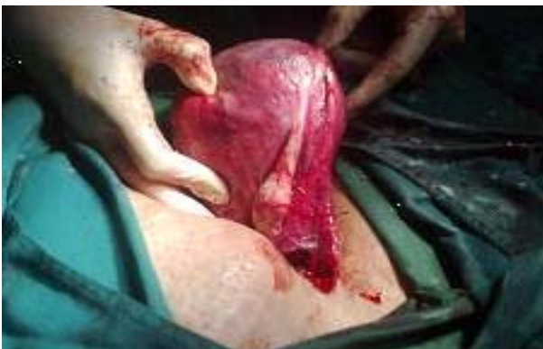
Figure 4. Normal right adnexa without any adhesion or hydrosalpinx is seen during cesarean section.