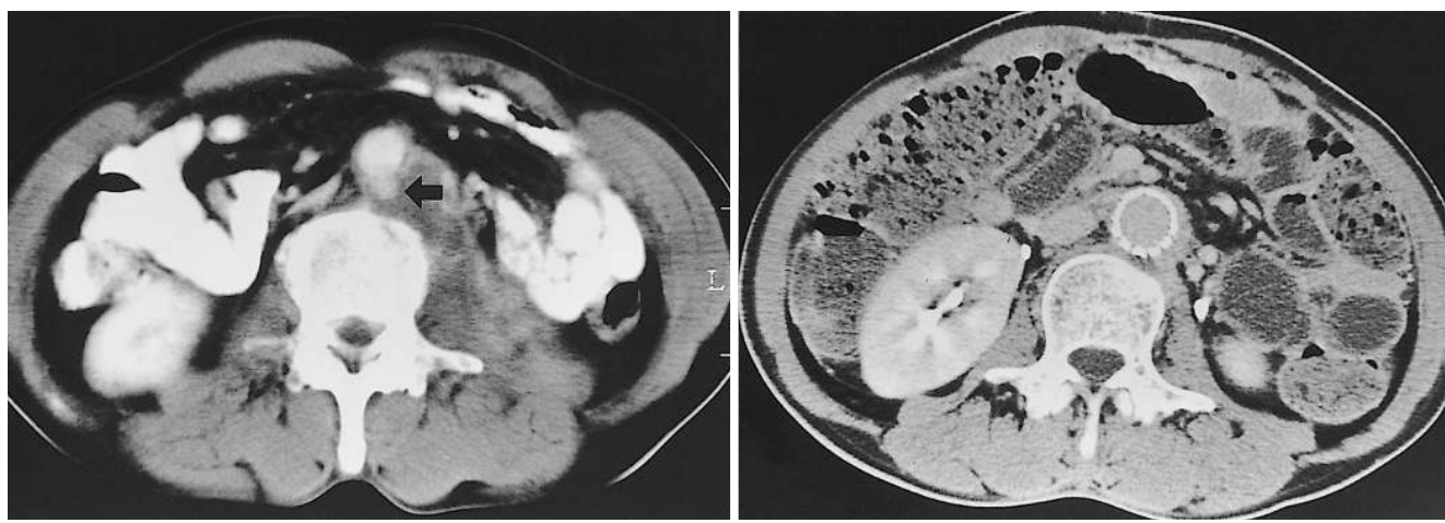
Fig. 2. A 41-year-old man with rupture of aortic aneurysm during surgery for drainage of psoas abscess. A. Pre-operative enhanced CT shows psoas abscess with a small aneurysm of the aorta (arrow). B. Three months after stent graft deployment, the mycotic aneurysm was occluded and the psoas abscess had completely healed.

To our knowledge, our reports are the first to describe the non-surgical treatment of tuberculous aortic aneurysm