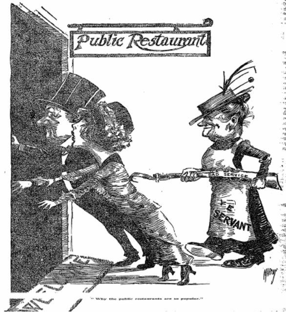
Figure 3: "Why the Public Restaurants are So Popular," 1913 ( New York Times Sunday Magazine )

type, providing a variety of cuisines from beefsteak and fish to bratwurst and spaghetti. These restaurants began to attract middle-class diners. As thousands of new restaurants amenable to