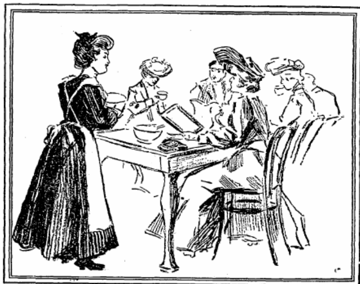
During Shopping Hours.

The growing number of women diners encouraged entrepreneurs to open restaurants that catered exclusively to women. In 1893, one of the first lunch counters solely for women opened