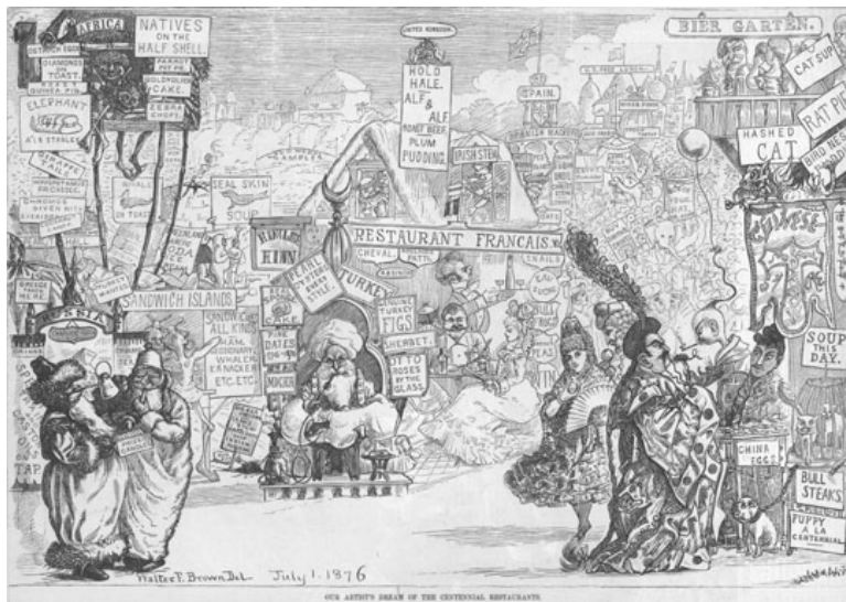
Figure 4: Walter Brown, “Our Artist’s Dream of the Centennial Restaurants,” 1876 ( Harper’s Weekly )

A few months after the fair opened, Harper's Weekly published a special supplement dedicated to the Centennial. Slipped among the etchings of Centennial buildings was a sketch by