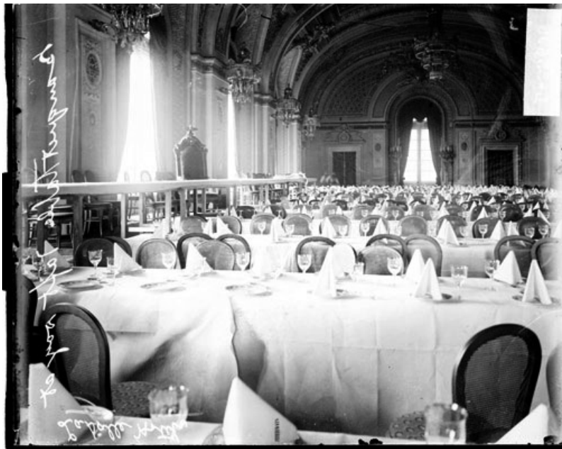
Figure 6: La Salle Hotel, 1909

American menus. At the turn of the century, the dish was rechristened as Spaghetti l'Italienne (suggesting a growing American familiarity with Italian pasta styles) and served southern Italian-style with a tomato sauce, but the dish was now considered a side-dish and was usually listed on