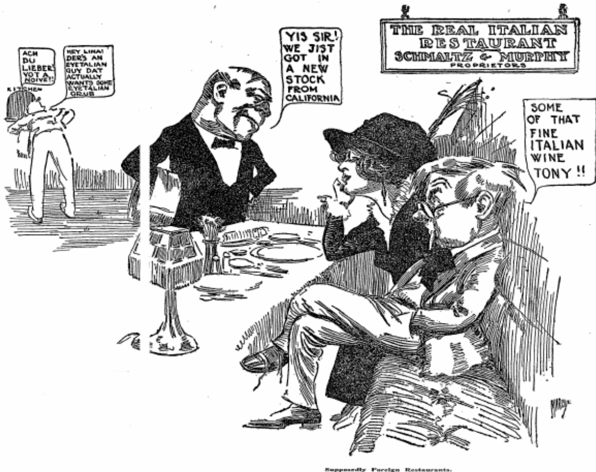
Figure 5: "Supposedly Foreign Restaurants," 1913 ( New York Times )

Eyetalian guy that actually wants some Eyetalian grub.” 55 In the article that accompanied the cartoon, the writer bragged that he has found two authentic immigrant restaurants—one Arab, the other Italian—but refused to name them because he feared that they would be quickly overrun. 56