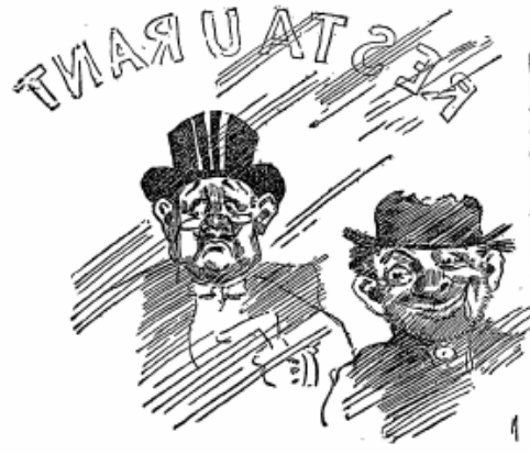
“Two Things Interfere With the Enjoyment of Food, Too Much Money and Too Little.”

“Two Things Interfere with the Enjoyment of Food, Too Much Money and Too Little.” 81