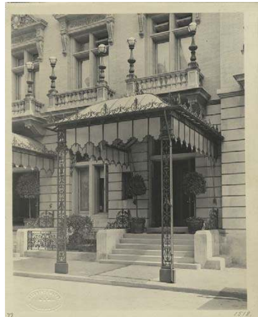
Figure 1: Delmonico's 1908

menu and acquired the services of Charles Ranhofer, a French-born and Paris-trained chef who would soon become America’s most celebrated cook. 26 “The opening of the Fifth Avenue