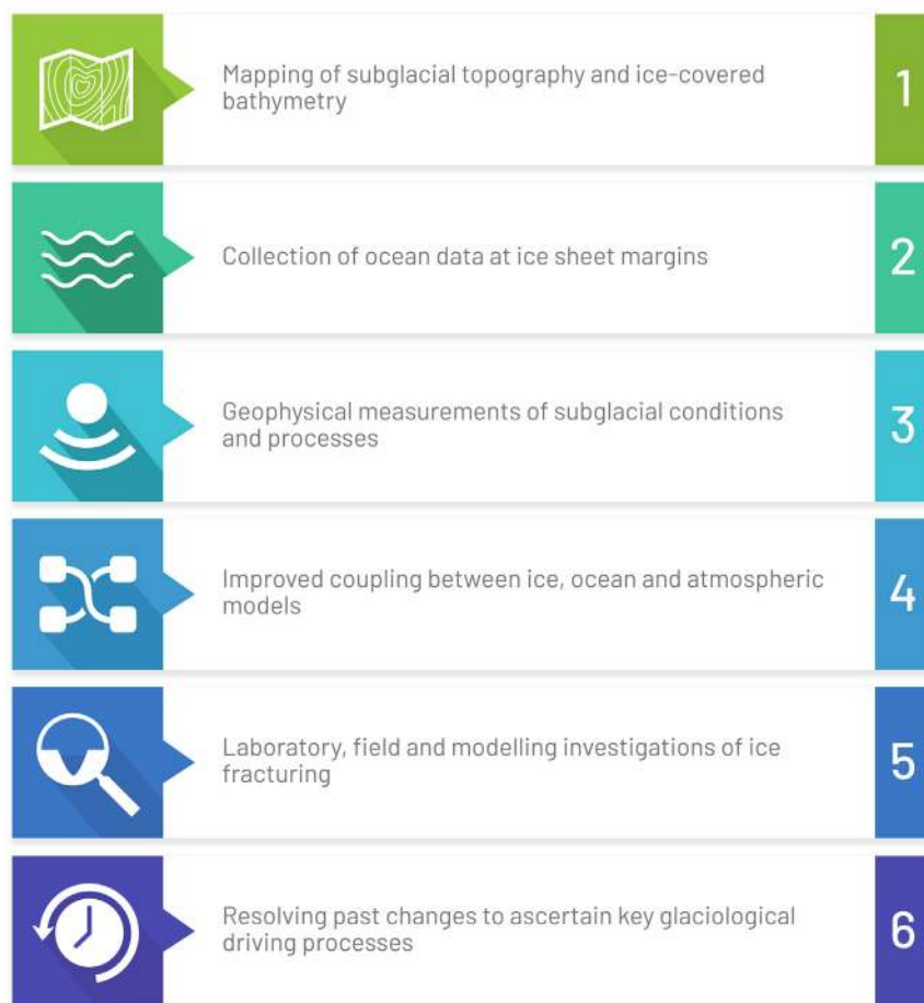
Figure 2. Six ways in which ice-sheet modeling, and thus sea-level predictions, may be improved under further research

tematically higher rates of sea level change than are currently projected by many models. 148