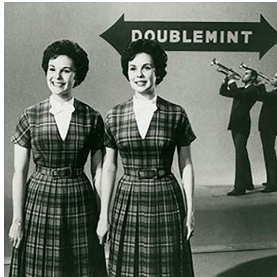
Fig. 1 and Fig. 2 8