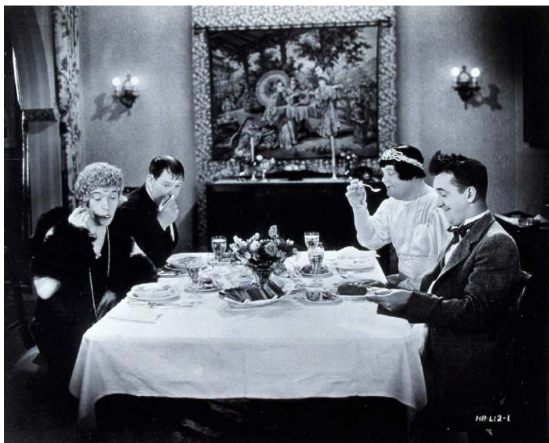
Fig. 4 19

between Laurel and Hardy operates on a movement that oscillates to and fro from one to two to two to one, like an endless game of fort-da between Being and Nothing, a game in which nothing changes. The dinner table, which stages the double-double, also features a ping-ponging of bickering and slapstick between one and one's opposite. The exchange is always between some version of Laurel and Hardy, but never the exact same combination of Laurel and Hardy. Even when nothing changes, the movement from one back to the other is not exactly the same. As Dolar puts it, "One cannot step into the same being twice" (Dolar 2017, 92).