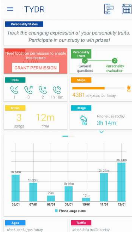
Figure 1: The main screen of TYDR that visualizes daily and weekly summaries of collected data.