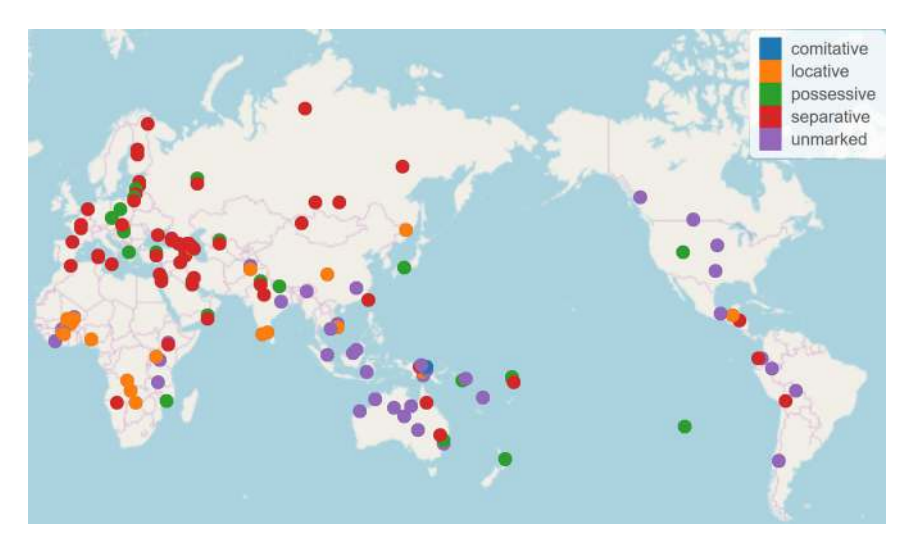
Figure 2: The geograpic distribution of the marking strategies<sup>32</sup>.