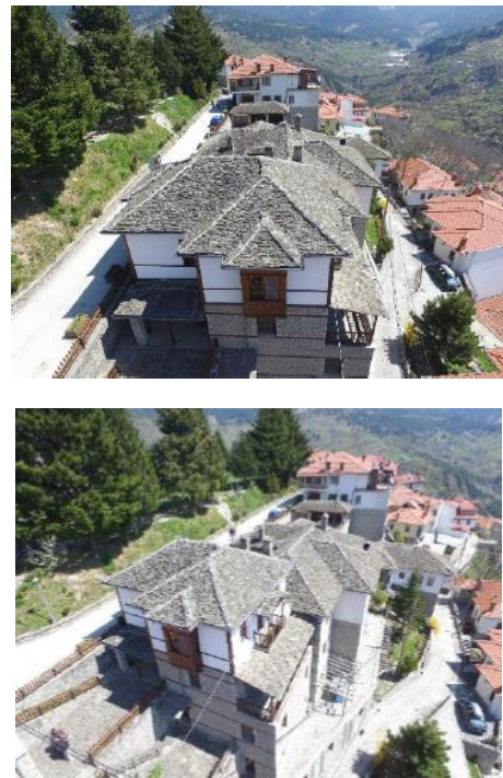
Figure 4: Aerial images of the Averof Museum captured with DJI Phantom 3 Professional

management and modelling of unknown data, objects, and relations in existing buildings (Volk et al., 2014). This advancement in the past decade, allowed for the remarkable development and use of BIM technology in the field of cultural heritage.