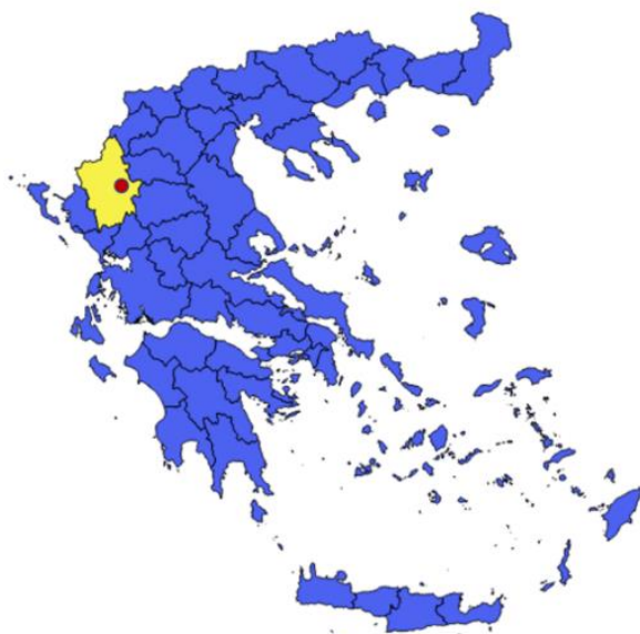
Figure 1: Metsovo village (red), Epirus region (yellow) (geodata.gov.gr, 2018)

The museum was inaugurated in 1988 representing the traditional architecture of Metsovo. The Averof’s Museum was undergone maintenance and restoration works in order to be transformed in a gallery without altering the exterior facade and its traditional character (Fig.2).