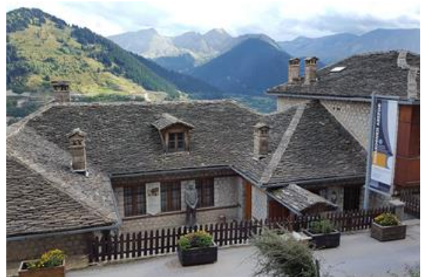
Figure 2: Averof’s Museum of Neohellenic art in Metsovo, Greece.