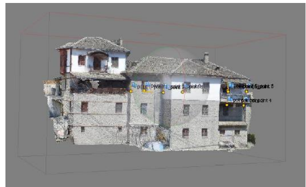
Figure 5: Textured mesh produced in Agisoft Photoscan

Historic Building Information Modelling (HBIM) is latter-day solution for generating parametric objects of architectural structures (mapped onto a point cloud or image-based survey) by using historic data (Murphy et al., 2013). Although BIM environments were initially structured to generate and manage from zero parametric geometries and create objects using existing libraries of shapes and conditions, however the HBIM approach was developed, referring to the process by which the architectural elements are collected; e.g. using a terrestrial laser scanner, and produced photogrammetric survey data are converted into parametric objects (Dore and Murphy, 2012). In this way, it is possible to document and manage any size or complex form of a cultural heritage object (Singh et al., 2011). Moreover, the BIM approach in the cultural heritage field allows the generation of a parametric model with specific standards and protocols that can be exchanged and processed from different professionals in order to be used for various use-cases (Osello and Rinaudo, 2016).