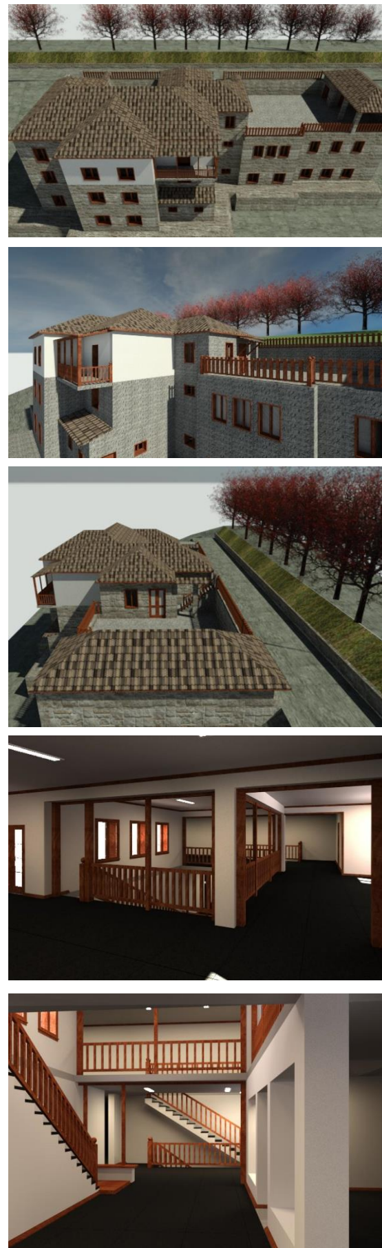
Figure 7: Snapshots from the BIM model

Recent experimentation in the field (Bruno and Roncella, 2018) indicates that even though there is lot to overcome in terms of costs, training and processing times, the utilization of “ HBIM in the cultural heritage field is a good solution and a potential for more coordinated and efficient management and preservation ”.