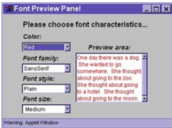
Fig. 5. Font panel; event handling is implemented entirely within UIML.

plex behavior, such as allowing buttons that change the appearance of the interface, without relying on procedural event handlers. For example, the font panel in Fig. 5 is implemented entirely in UIML without using procedural code (see uiml.org/papers/www8 for an example).