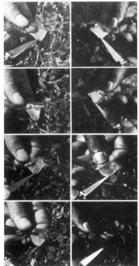
FIG. 2 An ultraviolet-enhanced video camera (CIDTEC) with a Flectan quartz reflecting lens (Nye Optical) was used to record the appearance of dewlaps under natural daylight conditions against a background of green grass. The first photograph in each row was made with filters passing light in the spectral range 400–680 nm. The second photograph in each row shows the relative brightness in the near-ultraviolet (320–400 nm) as isolated using a Hoya U360 filter plus an infrared blocker (Omega Optical). Contrast for the two spectral regions was equalized against a set of calibrated reflectance standards. The species shown are (top to bottom) A. cristatellus , A. pulchellus , A. gundlachi and A. evermanni . A. krugi (not shown) is similar in appearance to A. cristatellus .

Our results strongly suggest that ultraviolet vision is involved in anoline communication because: (1) dewlaps are used almost exclusively in communication and hidden at other times; (2) only species