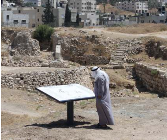
Figure 3. Various measurements are being taken to improve intellectual access to the site and to attract visitors to the Tell Balata Archaeological Park.

and presentation such as the ICOMOS 2008 Charter proposes. Otherwise, we are only paying lip service with our archaeological ethics, our heritage management conventions, charters and standards, and with our human rights resolutions if we sit back and wait further developments. Perhaps we cannot stimulate the physical and economic access for large parts of the Palestinian population, other than by establishing a variety of visitor facilities ( Fig. 3 ) which may create awareness and stimulate further learning, experience, and exploration, but we do not have to stay silent. We should at least point out this social and economic injustice to the world, repeatedly if necessary.