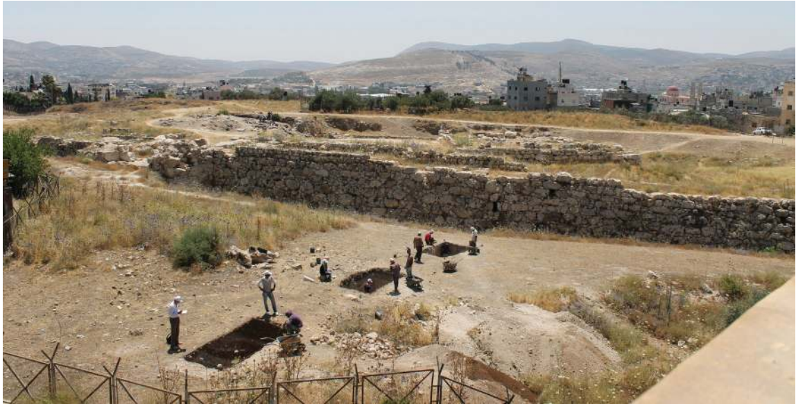
Figure 1. Tell Balata is worth a visit, and some religious tourists and pilgrims do, but the largest part of the international tourists does not leave Israel for a visit to the West Bank region of Palestine.

influenced? The charter itself, nor any other heritage charter, declaration, or professional standard is very helpful in dealing with such complications. In this paper, the situation that we encountered in the West Bank region in Palestine with regard to local heritage consumption, tourism, and the economic benefits will be highlighted and considered in the context of social inclusion and human rights. Discussion on whether archaeologists, site managers, and other heritage professionals could and should do more –apart from trying to implement the principles of our charters and conventions– to try to help improve the situation in difficult countries like Palestine, will also be included in this article, as well as, what the role of the public could be.