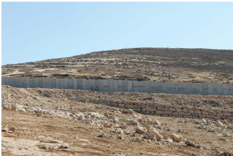
Figure 2. The Separation Wall that is under construction since 2003 will be a 725 km long structure that runs through the West Bank, mostly on territory occupied by Israel. It isolates lots of communities and separates tens of thousands of people from services, lands, and livelihoods (World Bank 2010, 12) and it forms a time-consuming obstacle for travel.

These physical barriers are however not the only obstacles for people to move around. There are also legal impediments. For instance, people living at the West Bank need a permit to visit the place they consider their capital, East-Jerusalem, but these are difficult to obtain (Suleiman and Mohamed 2011: 42). For people living in Gaza the situation is even more difficult as they are not able to leave the area, except to go to Egypt. They are not allowed to travel through Israel or to use the Ben Gurion Airport. In fact, persons with a Palestinian passport (even people who live abroad and who own a second foreign ID-card) are, according