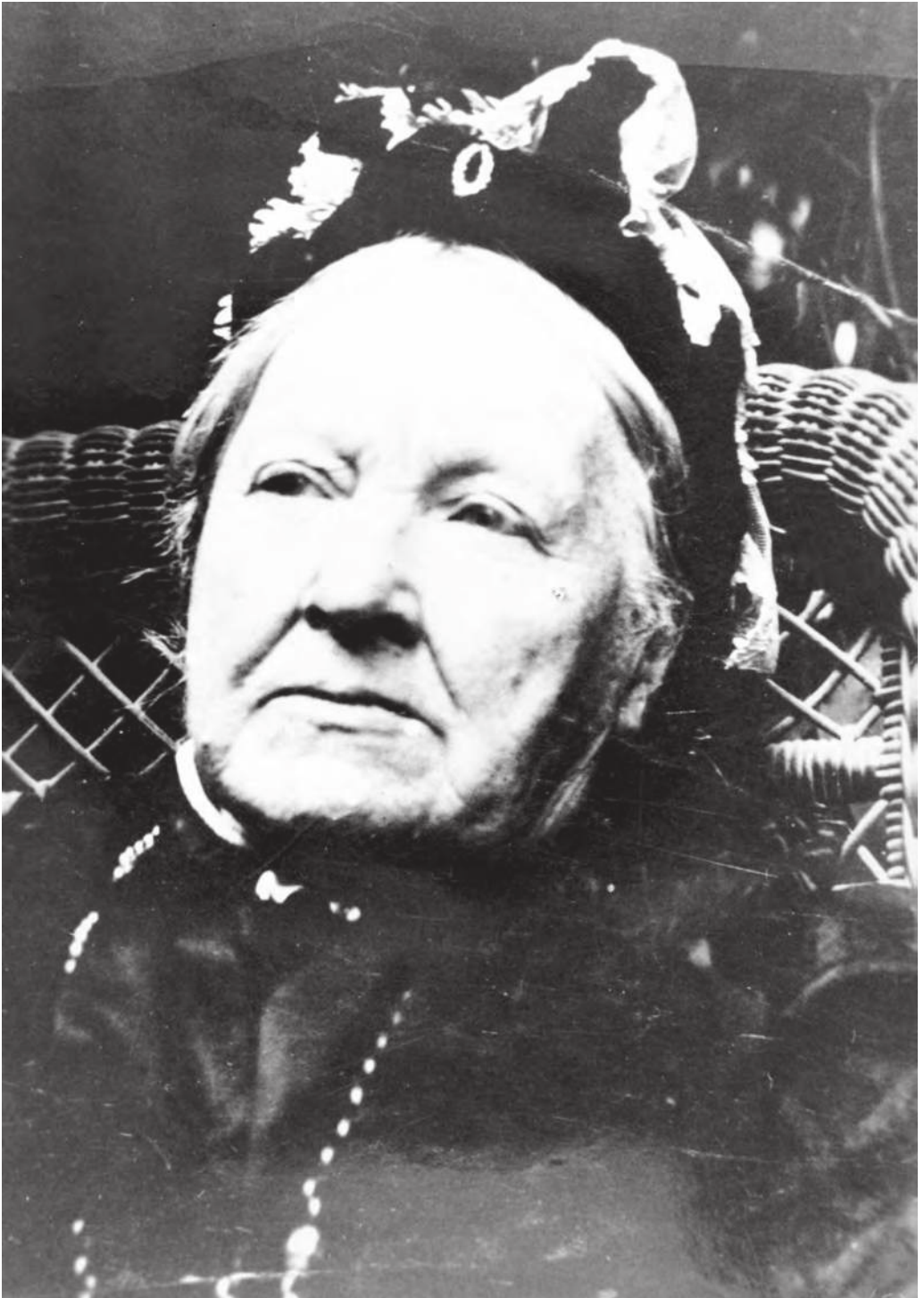
Catherine Helen Spence in Rose Scott's garden, Sydney 1902.