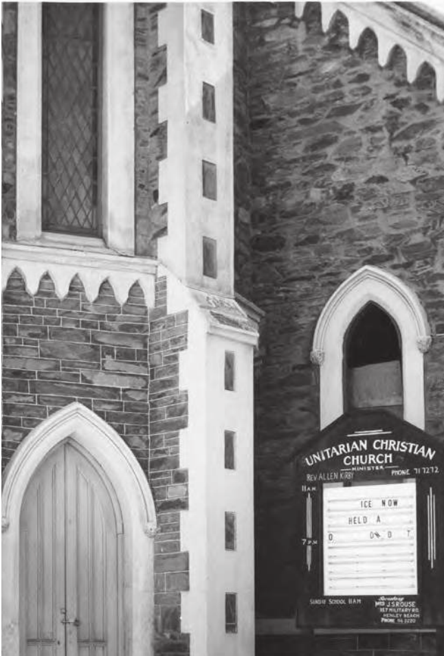
Unitarian Christian Church, Wakefield Street, Adelaide.

London School Board in the 1880s and 1890s, Octavia Hill's rent-collecting and Beatrice Webb's work for Booth's survey of the London poor, furnish only four of many possible examples. 34 But in South Australia, a colony founded with the express intention of implementing social and political measures thought unachievable in Britain, the Unitarians' collective zeal for change was less marked. As Spence observed in 1897, 'In my long membership with this church I do not recall any effort outside of itself'. 35 Nevertheless, as members of a minority faith – Unitarians were never more than 1 per cent of South Australia's population during the 19 th century – the Adelaide congregation was concerned with the spread of religious toleration. They aimed at 'the removal of prejudices and the creation of a spirit of enquiry which ... must in the end be beneficial to the cause of liberal Christianity'. 36 The readiest means available to them was that expressly urged upon them from their pulpit – education.