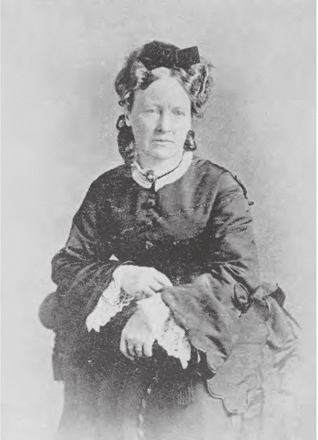
Catherine Helen Spence.