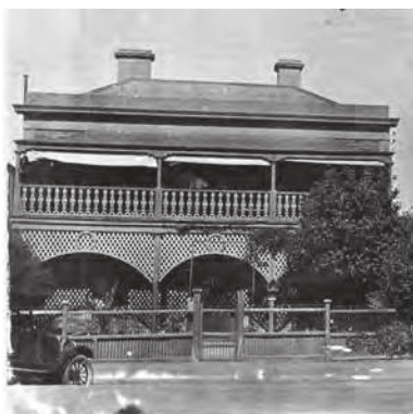
Advanced School for Girls.

be enabled to find rewarding work, but to do so, they must have access to a more useful education that ‘the pretentious programme of the young ladies’ seminary’. 39 The University of Adelaide, established in 1874, was to assist the struggle when, in 1880, it announced that it would admit women to courses for degrees. 40 By then Morgan’s government had already capitulated: the state Advanced School for Girls was opened in October 1879. 41