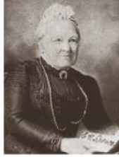
Catherine Helen Spence