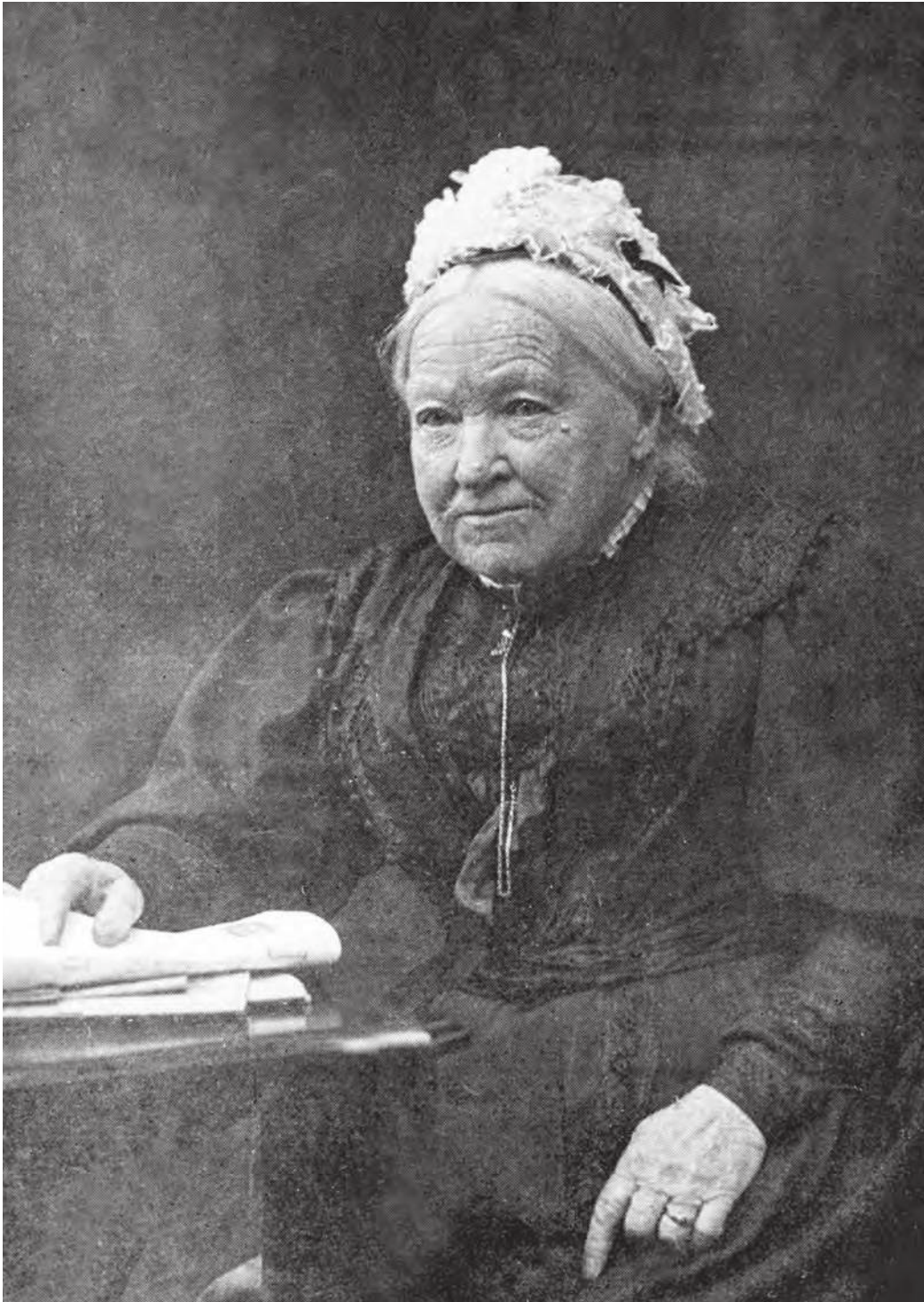
Catherine Helen Spence, the Grand Old Woman of Australia.