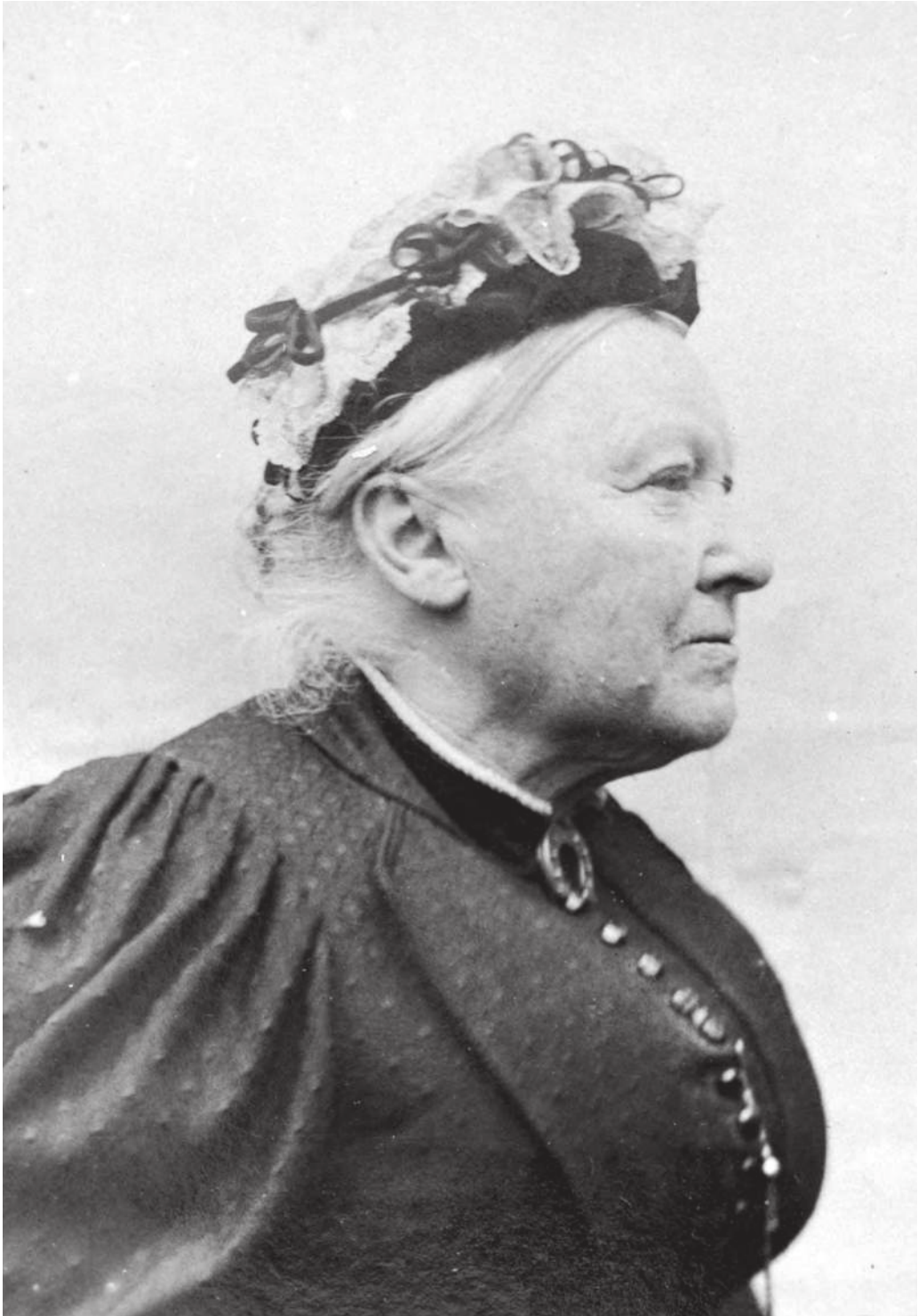
Catherine Helen Spence. Image courtesy of the State Library of South Australia, SLSA: B3675.