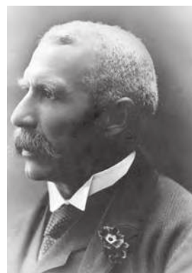
Edward Charles Stirling.

Stirling had been in England acquiring degrees and fellowships in natural science and medicine in the 15 or so years since he and his family had travelled there, with Catherine Spence for company, in 1864. His English acquaintances included the Fawcett family, and he was in correspondence with William Woodall, a liberal member of the House of Commons, who introduced into that House measures for extending the franchise to women, twice in 1884, and again in 1885. 38 It was not particularly surprising that, having returned to South Australia and gained a place in the House of Assembly, Stirling should have sought the same there. After all, the traditions established by the colony's founders depicted it as a more liberal society than that of Britain; a thoroughly progressive liberal measure might well stand a better chance there. Arguments against such a measure which appealed to 'natural'