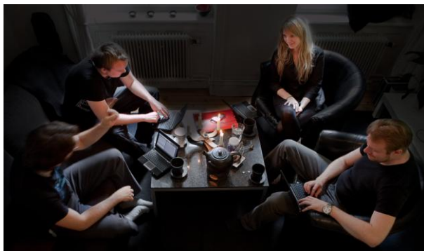
Figure 2. Typical use situation of Undercurrents , with the game master (and one of the researchers) in the lower left.

With the first software prototype developed, a prototype trial was set up using the netbooks and the Undercurrents system. The actual gameplay use situation, i.e. a role playing session, was selected instead since this allowed one of the researchers to be GM (and thereby being able to mitigate possible technical problems) and, more importantly, allowed participatory observation of how the social interaction was affected by the system. Besides the GM, the group consisted of four players (3 males, 1 female; 19-33 years old). The participants were provided with dinner and soft drinks throughout the 5½ hour session.