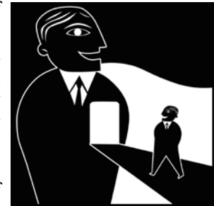
Figure 1: An Emotional Intelligence Assessment Tool for the Workplace

The intelligence quotient, or IQ, is a score derived from one of several different standardized tests to measure intelligence. 1 It has been used to assess giftedness, and sometimes underpin recruitment. Many have argued that IQ, or conventional intelligence, is too narrow: some people are academically brilliant yet socially and interpersonally inept. 2 And we know that success does not automatically follow those who possess a high IQ rating.