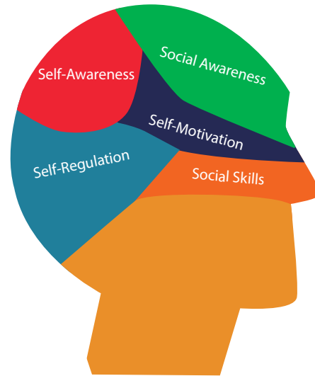
Figure 2: The Domains of Emotional Intelligence