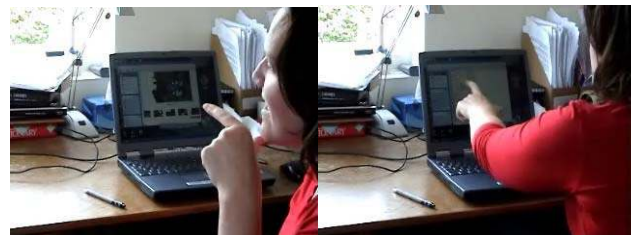
Figure 1. A participant in the study being interviewed in front of her laptop.

Our participants used a mixture of laptops and desktop PCs (with one participant using a Media Centre to work with his photos). Only the Mac users in the study used any kind of digital photo album software, although two of our PC-using participants used camera-specific proprietary software for managing the download of their pictures.