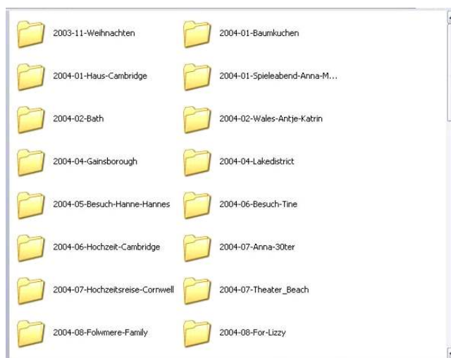
Figure 3. Typical folder structure for a participant.

This meant that users often relied on using Windows Explorer to navigate their picture archive. The obvious exceptions to this were the two Mac users who inevitably used iPhoto, but this decision was clearly more related to the fact that it had been so heavily integrated into the operating system rather than any active choice.