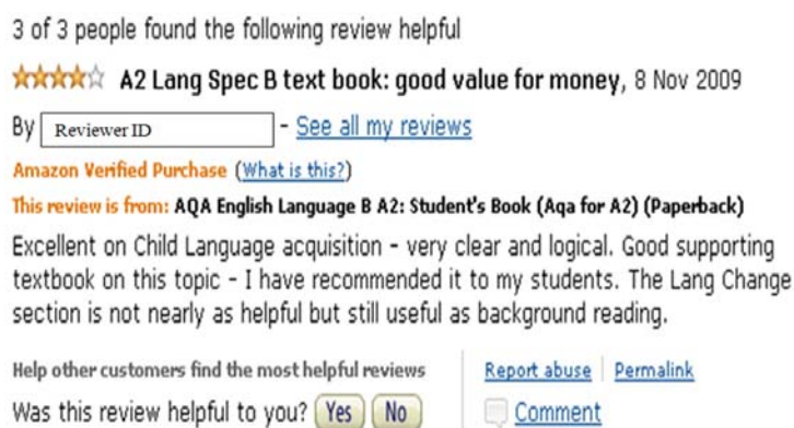
Figure 1: A sample review posted in Amazon

For each review, the following data items were obtained: review rating, review title, review date, review text, number of helpful votes, and number of total votes attracted by the review. In addition, information about the reviewer, including reviewer ID, number of helpful votes, and number of total votes received by the reviewer from all previously contributed reviews, were also retrieved. Figure 1 shows a sample review posted in Amazon. The Reviewer ID has been concealed for the sake of privacy.