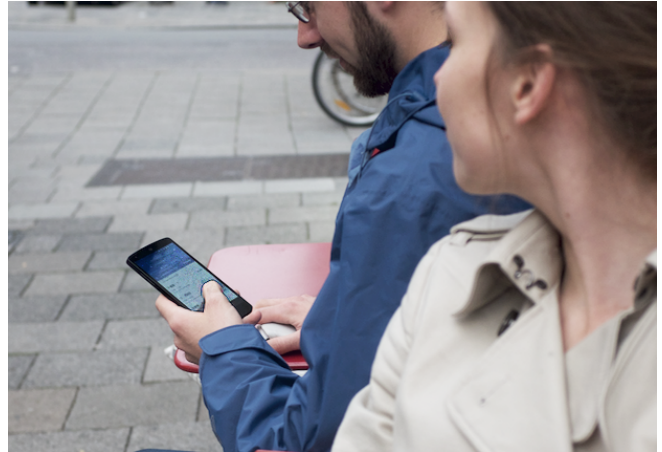
Figure 1. A shoulder surfing situation in a cafe.

DOI: http://dx.doi.org/10.1145/3025453.3025636